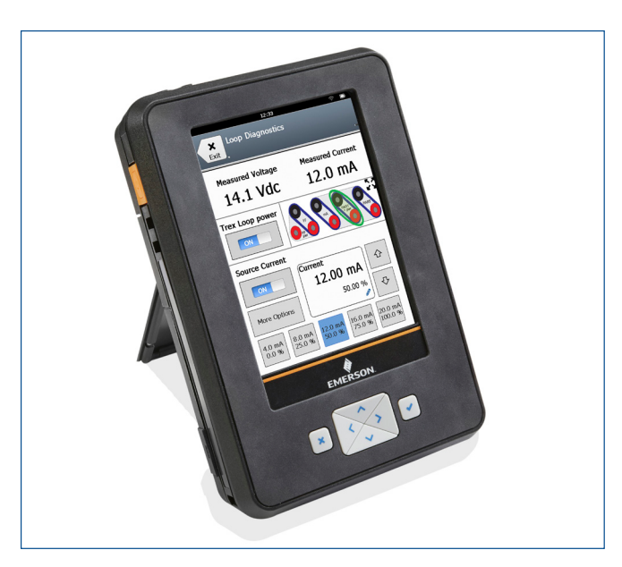
The rugged form factor is built for an industrial environment.