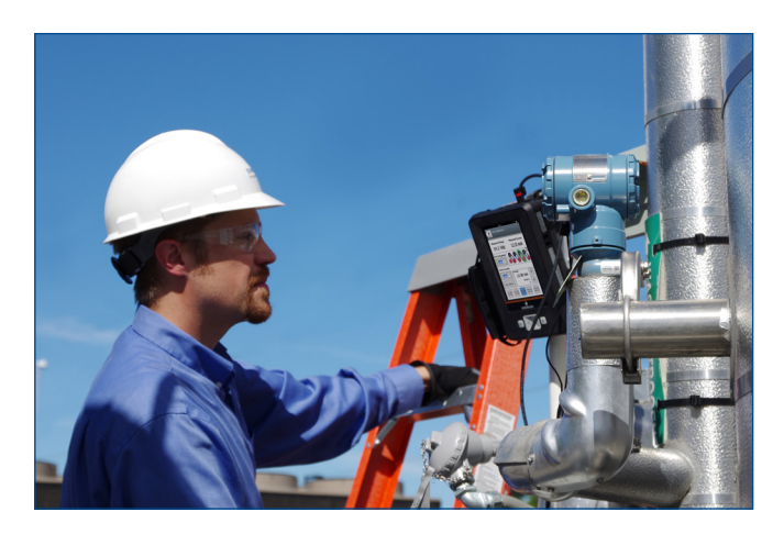
The magnetic hanger accessory allows you to attach the Trex unit to a pipe, freeing up your hands for other work.

You can also verify whether the DC voltage is correct in HART loops.