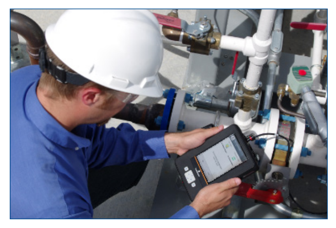
With the Trex communicator, you can do more in the field than ever before.