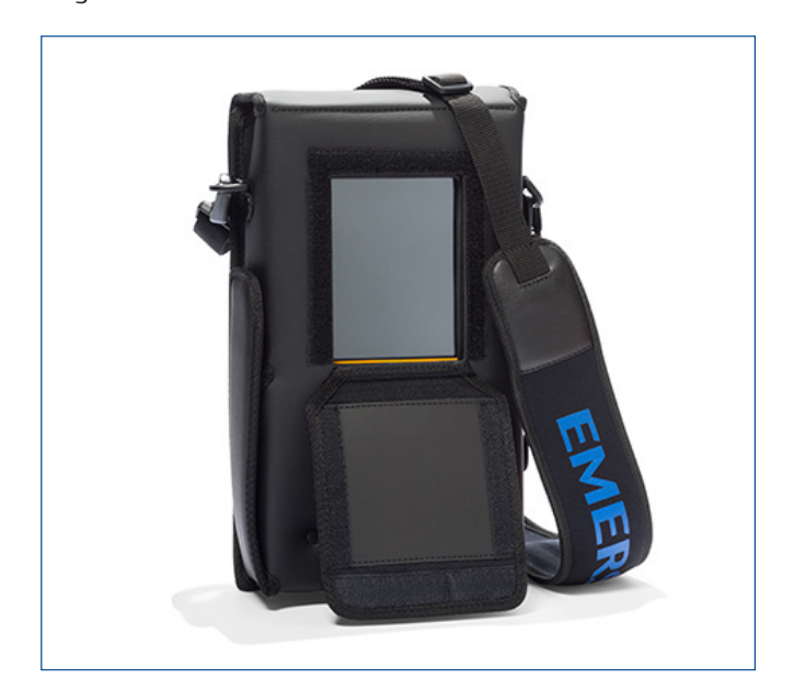
The useful carrying case protects your Trex unit in the field and provides storage options for accessory items.

Using the ValveLink Mobile app on the Trex unit, you can perform valve diagnostics in the field, including valve signature, dynamic error band, PD one button sweep, and step response, without having to pull the valve or perform invasive troubleshooting steps. ValveLink Mobile works with HART and FOUNDATION Fieldbus Fisher® FIELDVUE™ digital valve controllers and provides an intuitive user interface that is easy to understand and use. The large touchscreen on the Trex communicator makes it easier than ever to see all valve diagnostic details.